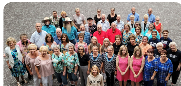
Group Photo, Seattle