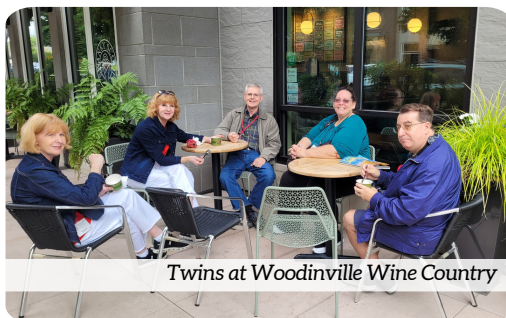
Twins at Woodinville Wine Country