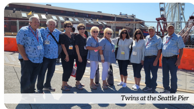
Twins at the Seattle Pier