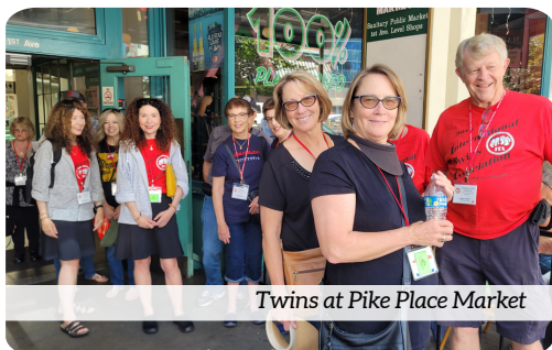
Twins at Pike Place Market