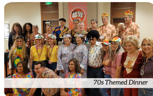
70s Themed Dinner